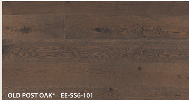
OLD POST OAK* EE-SS6-101