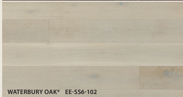
WATERBURY OAK* EE-SS6-102