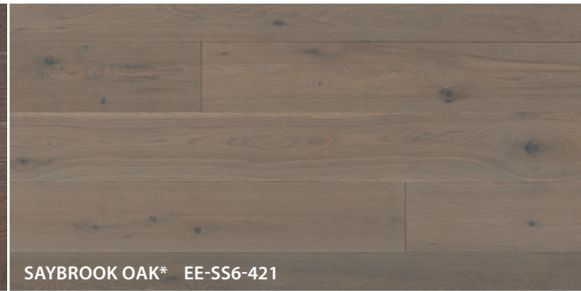
SAYBROOK OAK* EE-SS6-421