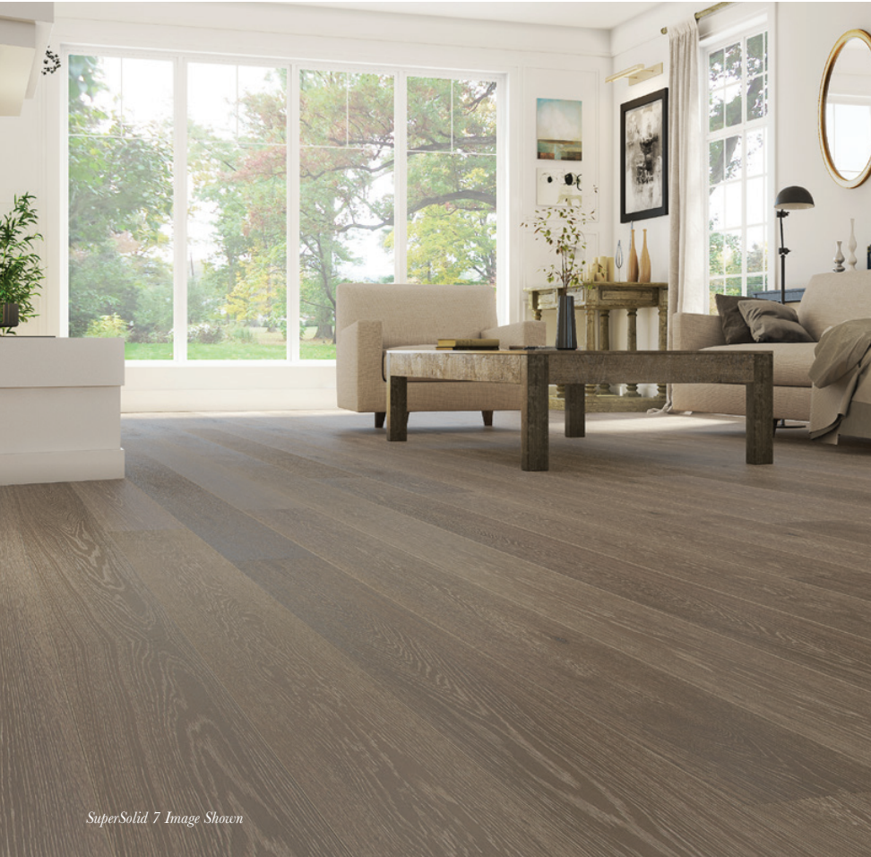
SuperSolid 7 Image Shown