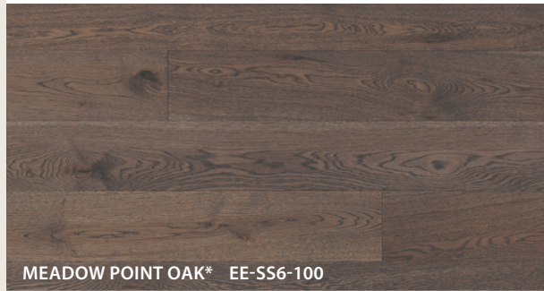
MEADOW POINT OAK* EE-SS6-100