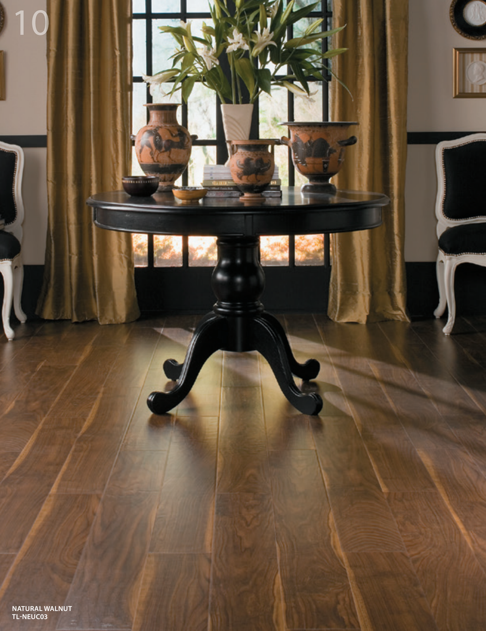
NATURAL WALNUT TL-NEUC03