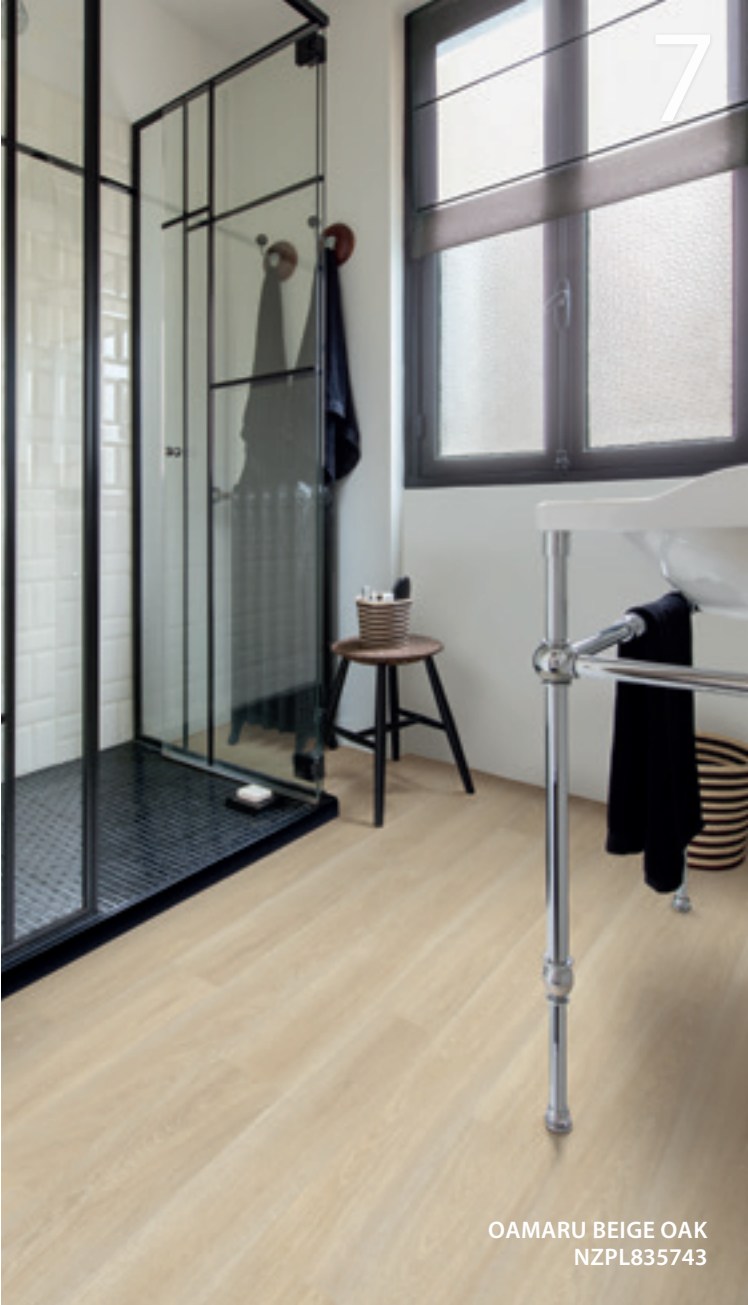
OAMARU BEIGE OAK NZPL835743

*High Shade Variation **"Waterproof Surface" Warranty when installed with a perimeter seal, see website for full details and installation information