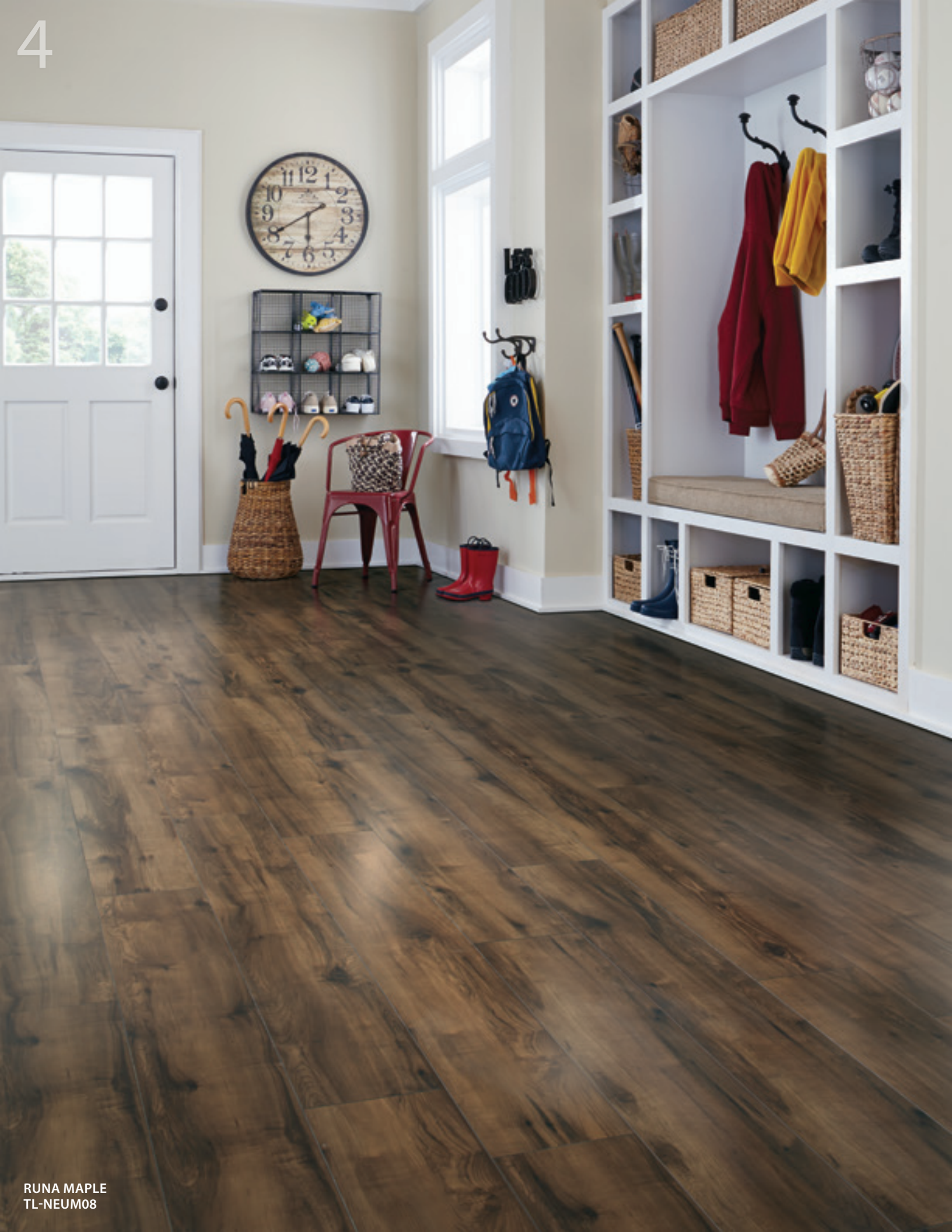
RUNA MAPLE TL-NEUM08