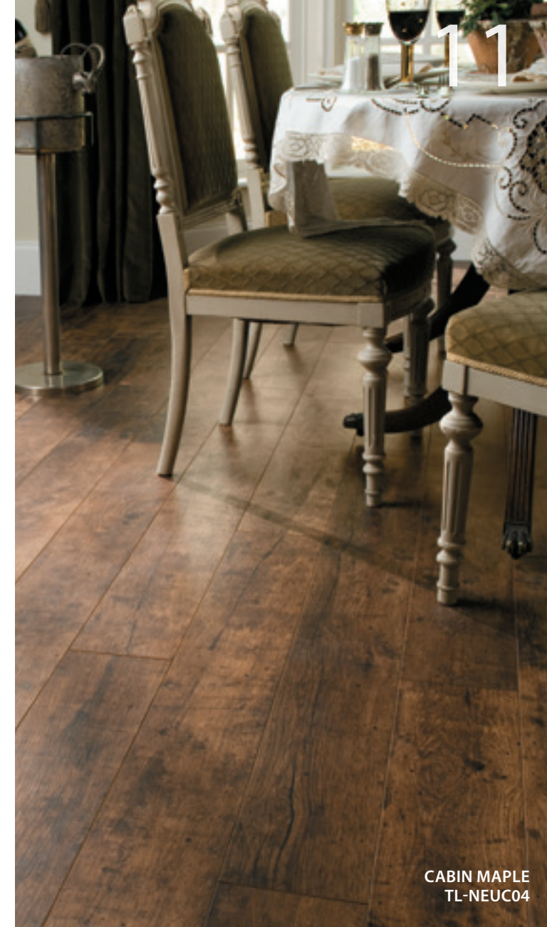
CABIN MAPLE TL-NEUC04