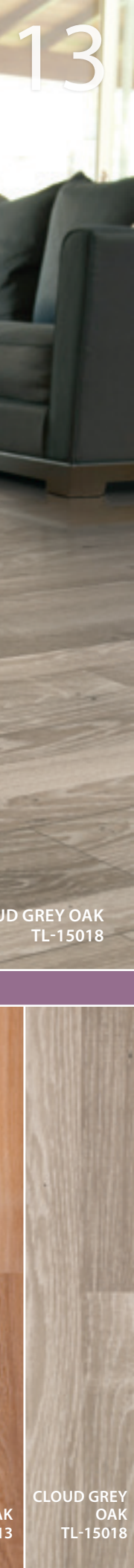
CLOUD GREY OAK TL-15018