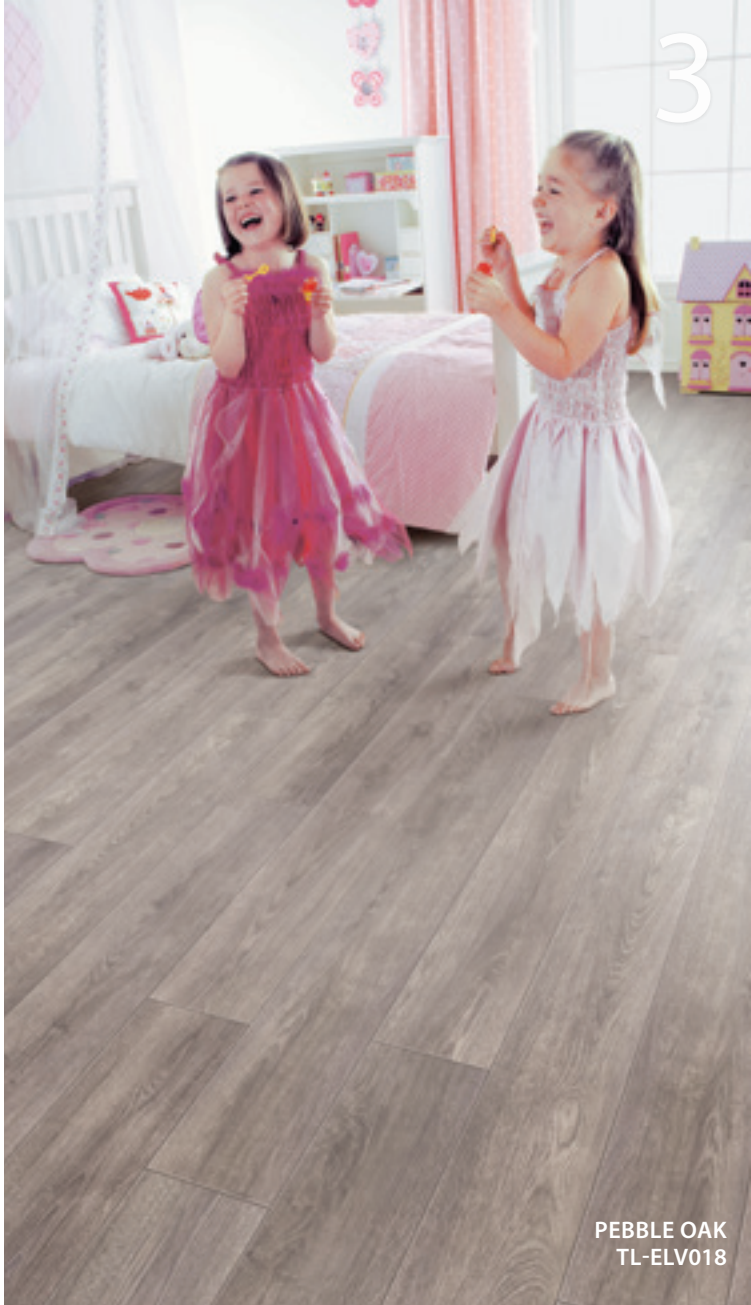
PEBBLE OAK TL-ELV018