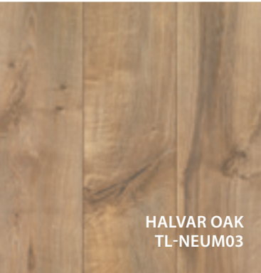
HALVAR OAK TL-NEUM03