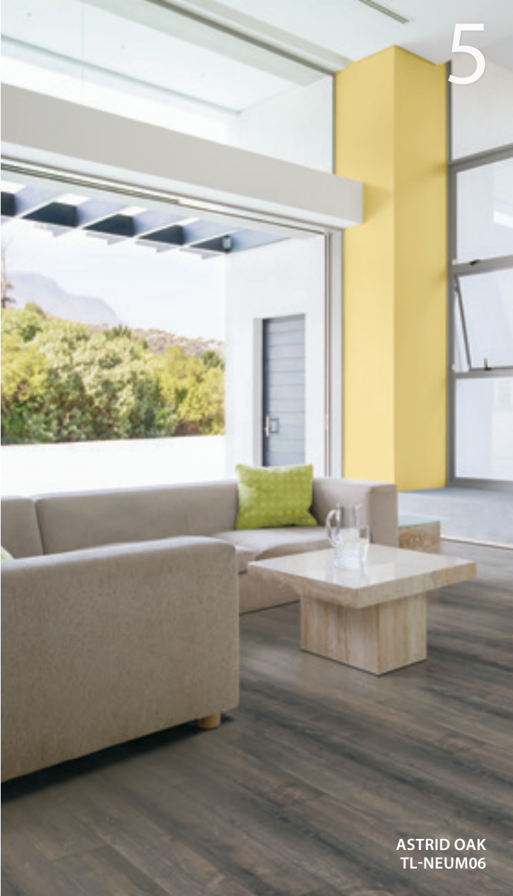
ASTRID OAK TL-NEUM06