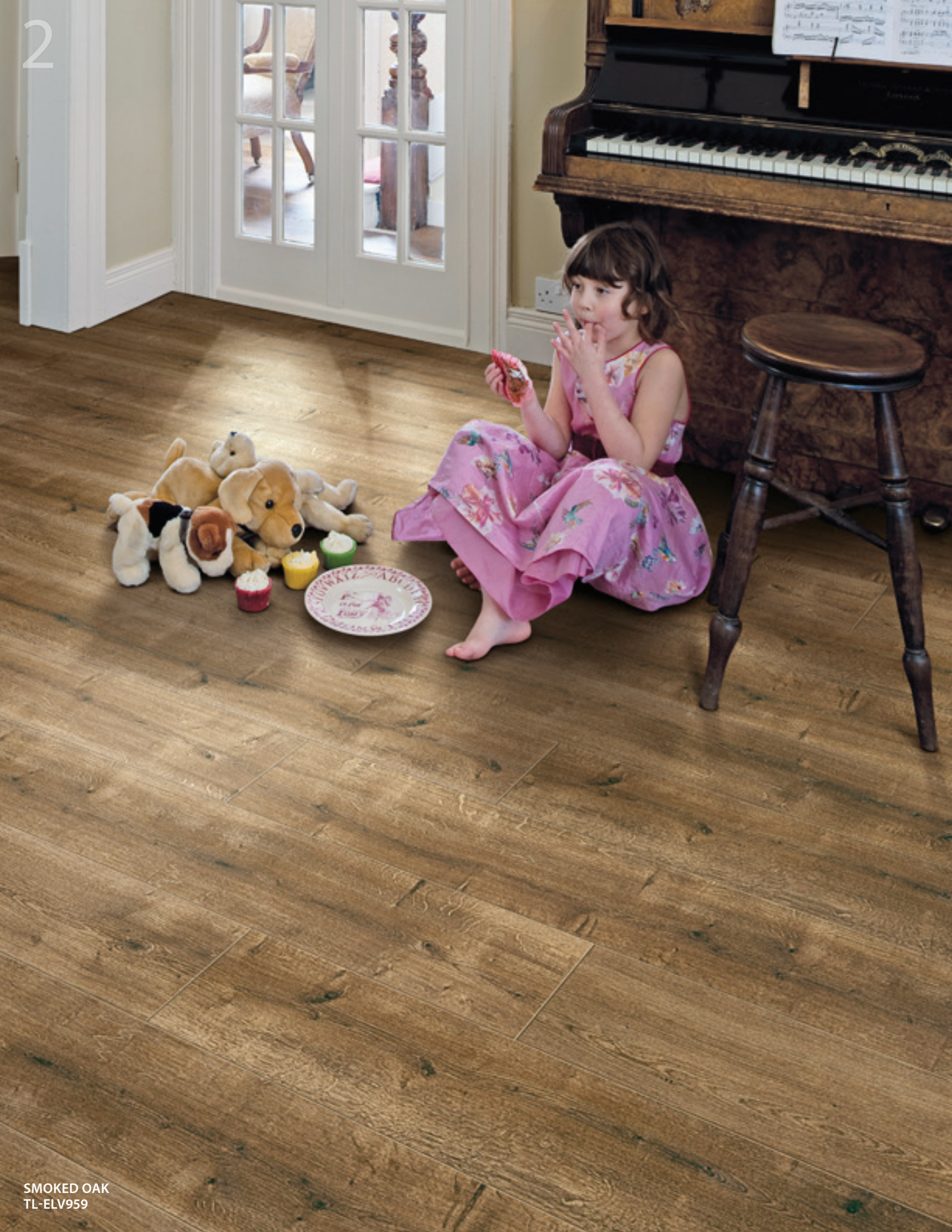
SMOKED OAK TL-ELV959