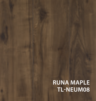
RUNA MAPLE TL-NEUM08