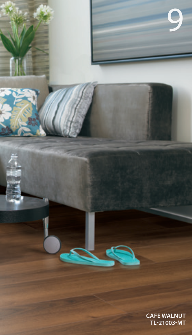
CAFÉ WALNUT TL-21003-MT