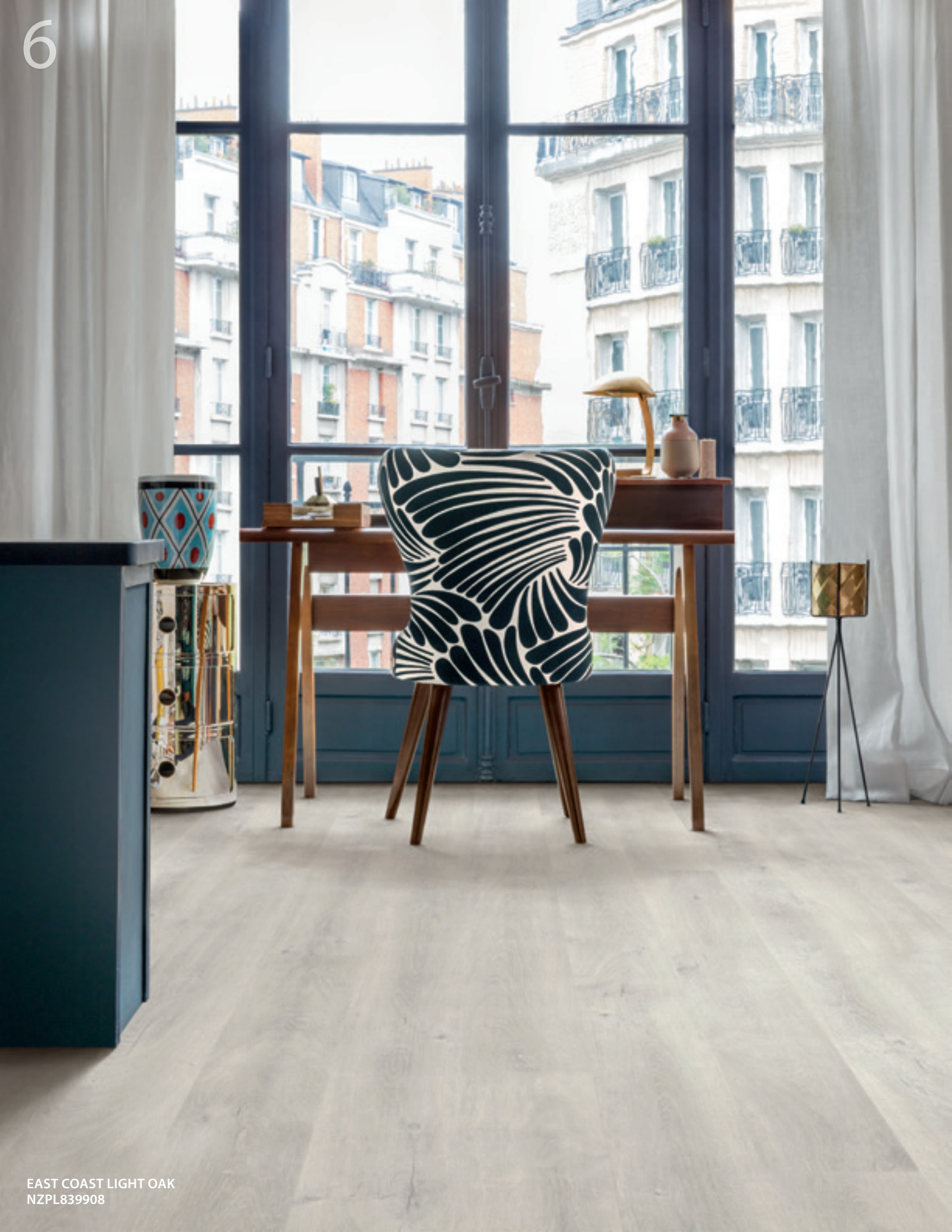
EAST COAST LIGHT OAK NZPL839908