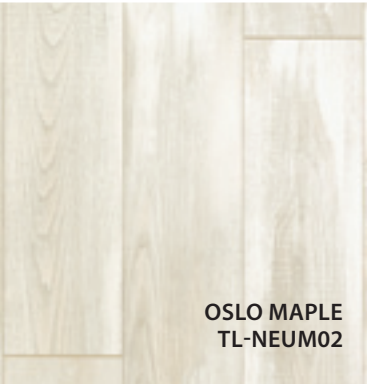
OSLO MAPLE TL-NEUM02