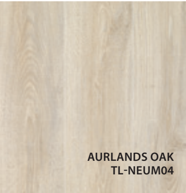
AURLANDS OAK TL-NEUM04