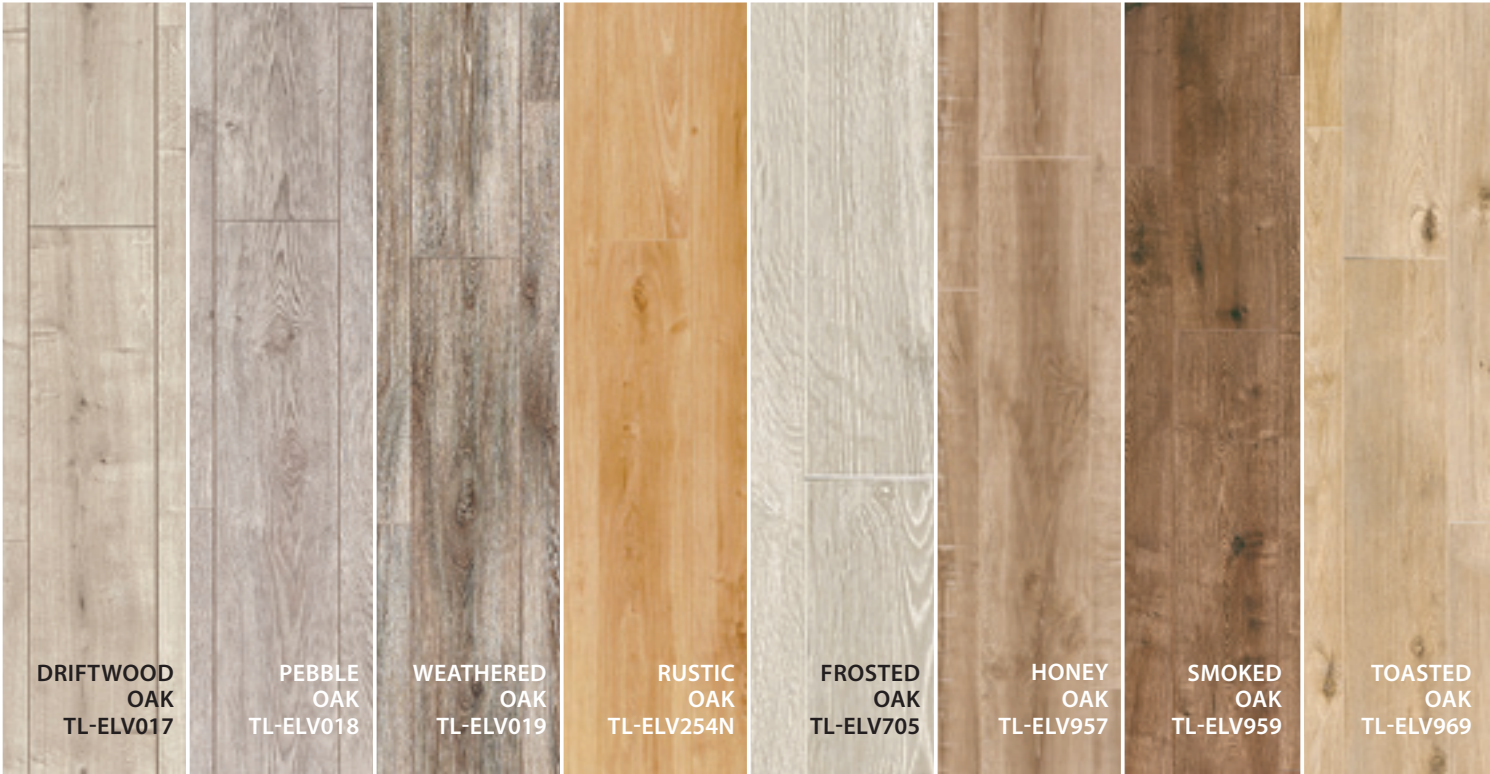
DRIFTWOOD OAK TL-ELV017