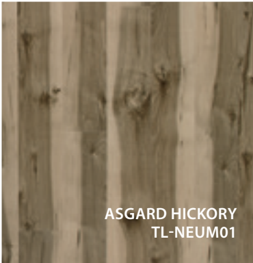
ASGARD HICKORY TL-NEUM01