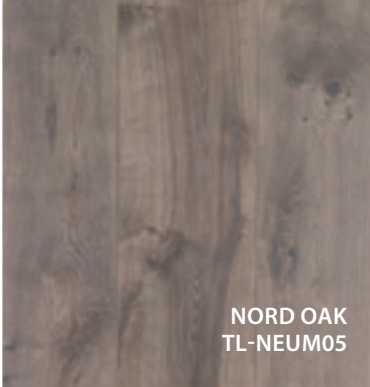
NORD OAK TL-NEUM05