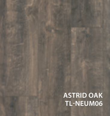
ASTRID OAK TL-NEUM06