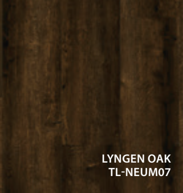
LYNGEN OAK TL-NEUM07